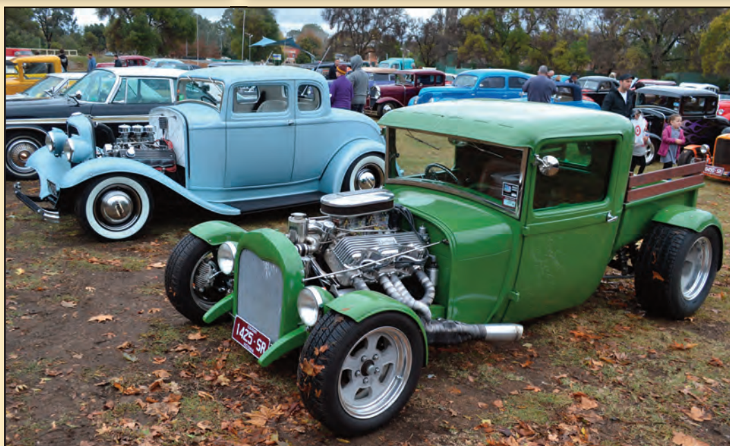
Right: The Goldfields Rod Run attracted almost 90 entrants to the Western Reserve in Castlemaine for the Show and Shine on Sunday May 1, 2016.