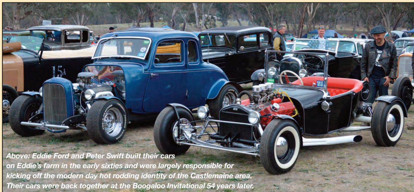
Above: Eddie Ford and Peter Swift built their cars on Eddie's farm in the early sixties and were largely responsible for kicking off the modern day hot rodding identity of the Castlemaine area. Their cars were back together at the Boogaloo Invitational 54 years later.