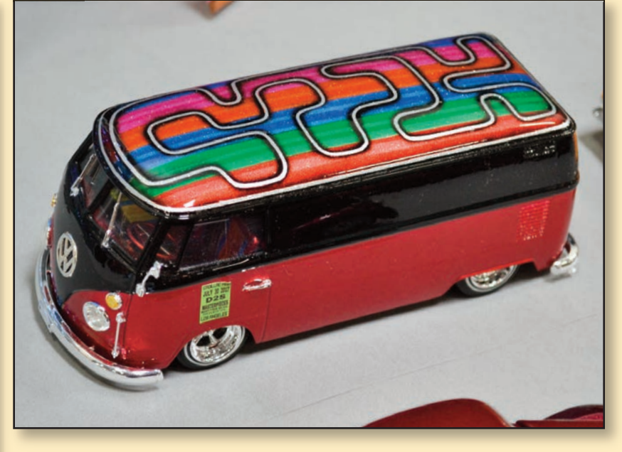
Above & left: Pictures shown here are from a model car show held in Los Angeles, USA in July, 2017 and give some idea of what a CHRC model car show might look like. This show also included low-rider bicycles which is another aspect that the CHRC could consider for inclusion in our own show in 2018. Our thanks to Alan Barton for supplying a comprehensive overview of show organisation based on a similar model car show held annually in Western Australia.