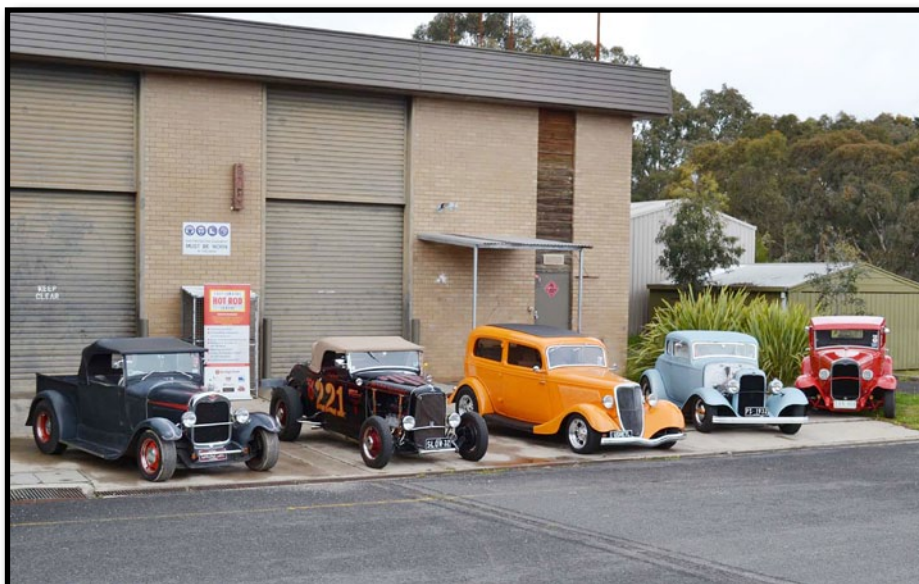
ABOVE: A site inspection and meeting is to be held at the Etty Street Campus of the Castlemaine Secondary College in mid September 2018. The inspection and meeting will be held between the local member, CEO of Mount Alexander Shire, a Workspace Australia representative, Education Department representatives and a Castlemaine Hot Rod Centre representative.

Following the September inspection and meeting the Board of the CHRC Limited will consider any outcomes and report back to the membership in due course. In the meantime we are continually updating the VACC, RACV and Kangan TAFE of our progress in order to keep them fully informed. Private discussions between CHRC and Workspace Australia representatives indicate we can work together at the campus in a complimentary way if and when access to the site is established.