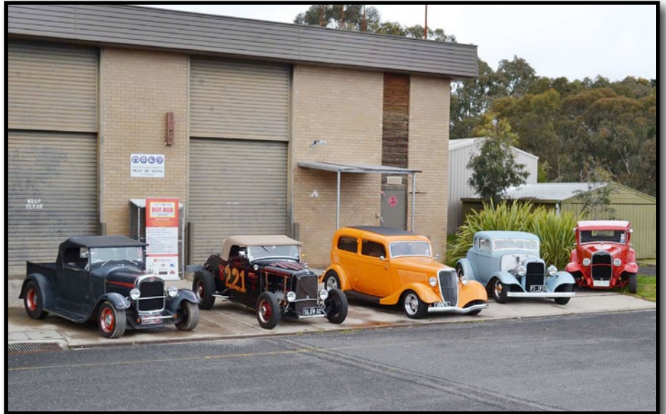
ABOVE: A site inspection and meeting is to be held at the Etty Street Campus of the Castlemaine Secondary College in mid September 2018. The inspection and meeting will be held between the local member, CEO of Mount Alexander Shire, a Workspace Australia representative, Education Department representatives and a Castlemaine Hot Rod Centre representative.

Following the September inspection and meeting the Board of the CHRC Limited will consider any outcomes and report back to the membership in due course. In the meantime we are continually updating the VACC, RACV and Kangan TAFE of our progress in order to keep them fully informed. Private discussions between CHRC and Workspace Australia representatives indicate we can work together at the campus in a complimentary way if and when access to the site is established.