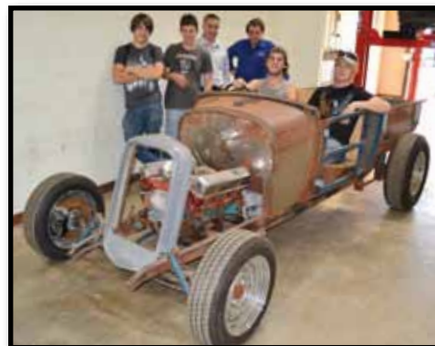
RIGHT: The school hot rod project has returned to Autoplex where plans are being formulated for renewed student participation.