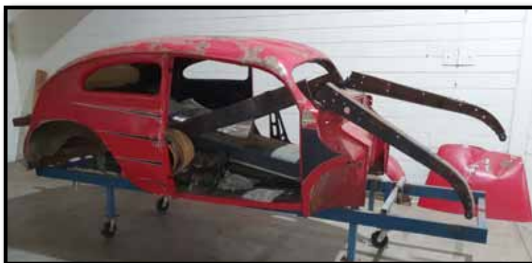
ABOVE: The damaged 1940 Ford sloper body donated by Peter Wolfe is repairable and will make an excellent teaching module for how to do such repairs.

The students working on the Falcon project (see below) have expressed an interest in turning their attention to the hot rod pickup next, so it looks like exciting times ahead for these eager young people.